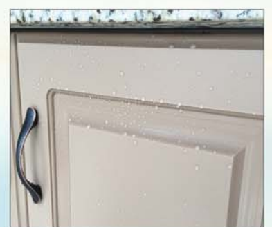
MOISTURE RESISTANT FOR ANY CLIMATE OR ANY SEASON